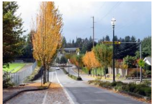
Thoroughfare in City of University Place, WA

The City of University Place in the Tacoma, Washington area has been successful at implementing complete street characteristics for pedestrians and bikers by developing public-private partnerships. For example, the City worked with the gas company to share costs for converting gravel shoulders into sidewalks during gas line replacements.