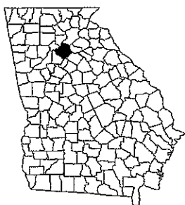
FIGURE 1 Project Location Map

GDOT Project STP-0006-00(439), Gwinnett County P.I. No. 0006439