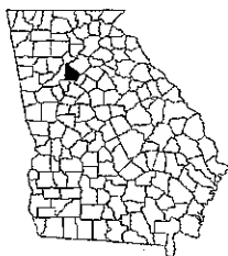
FIGURE 1 Project Location Map

GDOT Projects STP-0006-00(880), STP-0006-00(879), STP-0005-00(905), STP-0006-00(890), Dekalb County P.I. Nos. 0006880, 0006879, 0005905, 0006890