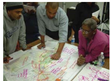
Cascade Road - Campbellton Road Corridor Plan workshop.