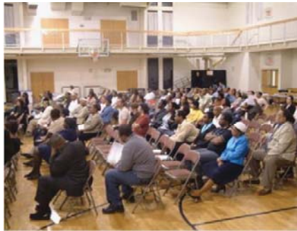
Community meeting for the South Moreland LCI.