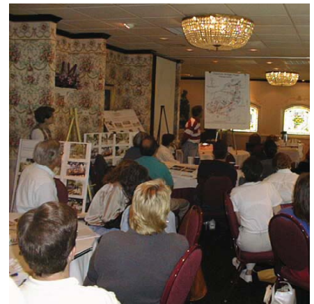
Cheshire Bridge Road Community meeting.