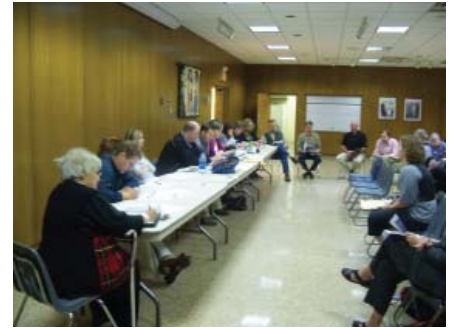
NPU planners will give periodic updates about the 2011 CDP at NPU meetings.

The second series of workshops will focus on delineating character area and identifying visions and policies for each. Input will be obtained on the collective vision for the future of the City as well as to solicit ideas for strategies and projects to include in the draft implementation program. The third series of workshops will finalize