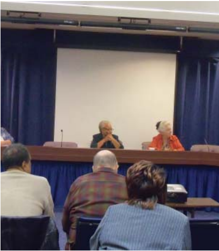
Periodic updates about the 2011 CDP will be given at APAB meetings.