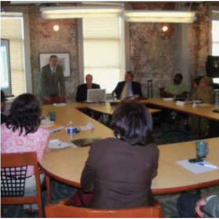
2011 CDP Population presentation at an Economic Development Subcabinet meeting.