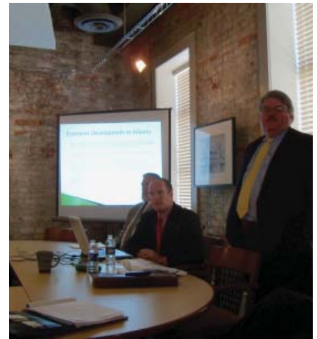
2011 CDP Economic Development presentation at an Economic Development Subcabinet meeting.

One example of a recent partnership is that with Sustainable Atlanta in their "EnvisionATL". EnvisionATL is a forum open to anyone interested in helping build a shared aspiration and vision for a more sustainable Atlanta. EnvisionATL starting October 2010 will begin conversations to develop a Sustainable Vision for Atlanta and to assist in the creation of their Sustainable Dashboard.