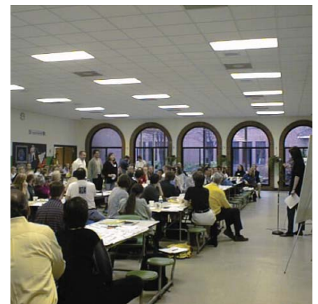
Workshop for the North Highland Corridor Plan