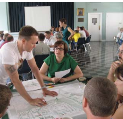
Poncey-Highland Master Plan community workshop.

character areas vision and policies and review preliminary policies in the Draft Community Agenda. A final community workshop will be held prior to the June 13, 2011 public hearing to present the major findings and recommendations of the Community Agenda.