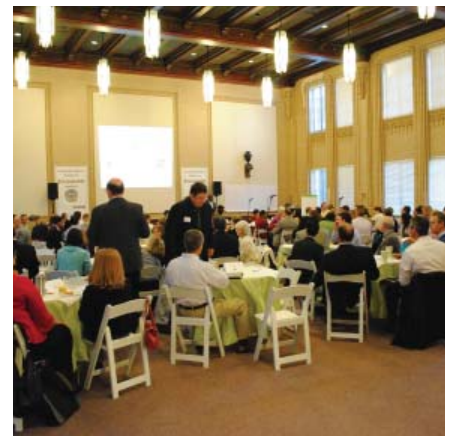
Sustainable Atlanta kicked off EnvisionATL on October 13, 2010 in the historic City Council Chamber.