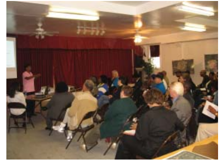
Community Meeting about Ft. McPherson.