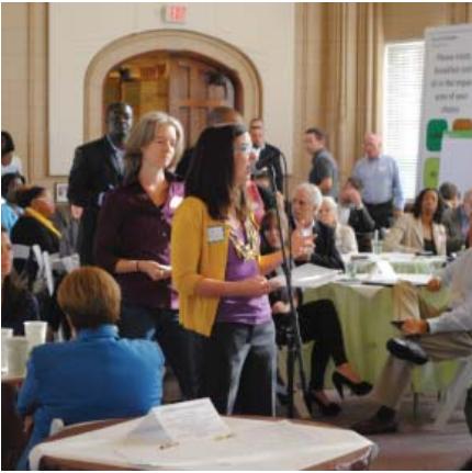
At EnvisionATL, each table presented their top three ideas.

The meetings will focus on many of the elements included in the CDP – land use, air, water, material resources, energy, transportation and food resources while taking into account the economy, social equity and well being. The overall vision statements as well as the visions for each area will be incorporated in the Community Agenda. The next round of community input is scheduled for December 7, 2010. Both events are based on the World Café conversation model. EnvisionATL will be formatted to promote conversations from diverse constituents in order to build consensus around Atlanta’s sustainability future. The event is presented by Sustainable Atlanta in conjunction with Mayor Reed and the City of Atlanta. There are numerous organizations and individuals tackling issues of sustainability around the Atlanta area. As these efforts continue, a shared vision for Atlanta will provide a foundation upon which to establish future discussions and efforts to make Atlanta a viable, competitive and healthier place for future generations.