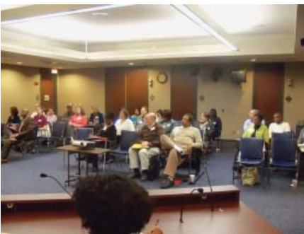
A presentation about the CDP planning process, the CPP and character areas was given at the APAB retreat on October 16, 2010.