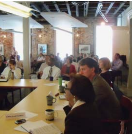
The 2011 CDP will be on the Economic Development Subcabinet agenda periodically.