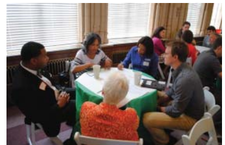
Small groups visioning sessions were held to discuss water, land, air and material resources at EnvisionATL.