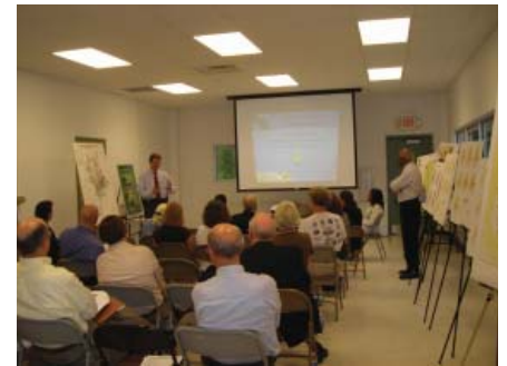
Community meeting for the 2008 CDP.