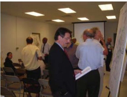
Community meeting for the 2008 CDP.